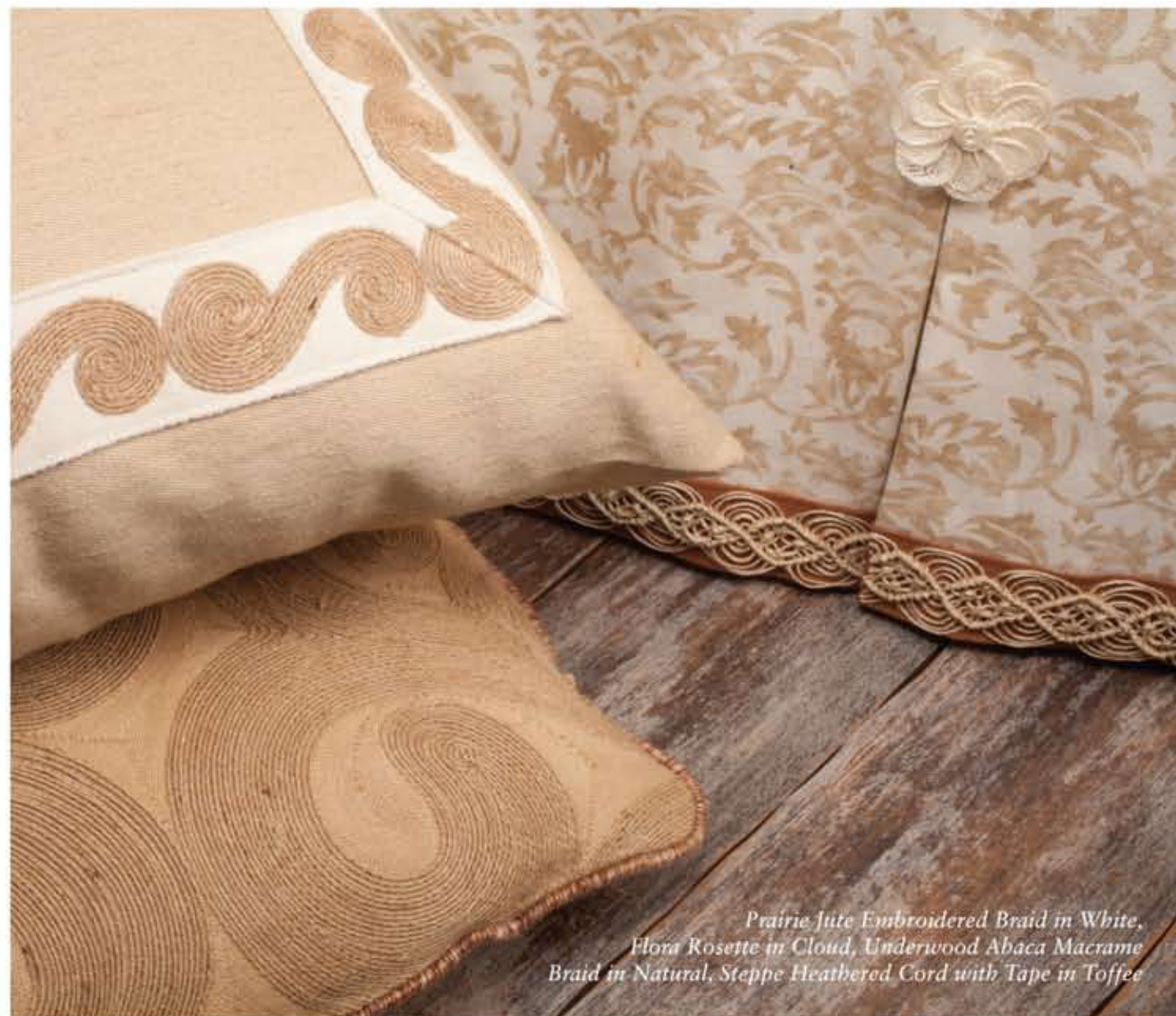
Prairie Jute Embroidered Braid in White, Flora Rosette in Cloud, Underwood Abaca Macrame Braid in Natural, Steppe Heathered Cord with Tape in Toffee

The Prairie Jute Embroidered Linen Border accentuates nature's inspiration with its dynamic scroll pattern. Rolling jute fibers swirl on serene hues of linen lending a sweeping yet delicate accent for pillows, furnishings and window treatments. The delicate Flora Rosette is composed of 100% abaca and redefines the preconceived notion of a rosette. The handmade craftsmanship is evident in the complex woven detailing reminiscent of lace accessories from the 1940s.