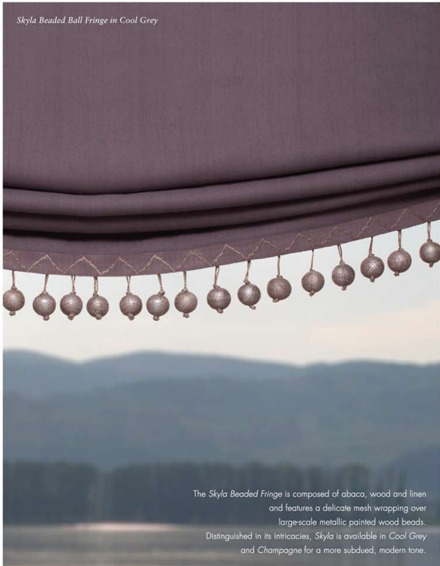
Skyla Beaded Ball Fringe in Cool Grey

The Skyla Beaded Fringe is composed of abaca, wood and linen and features a delicate mesh wrapping over large-scale metallic painted wood beads. Distinguished in its intricacies, Skyla is available in Cool Grey and Champagne for a more subdued, modern tone.