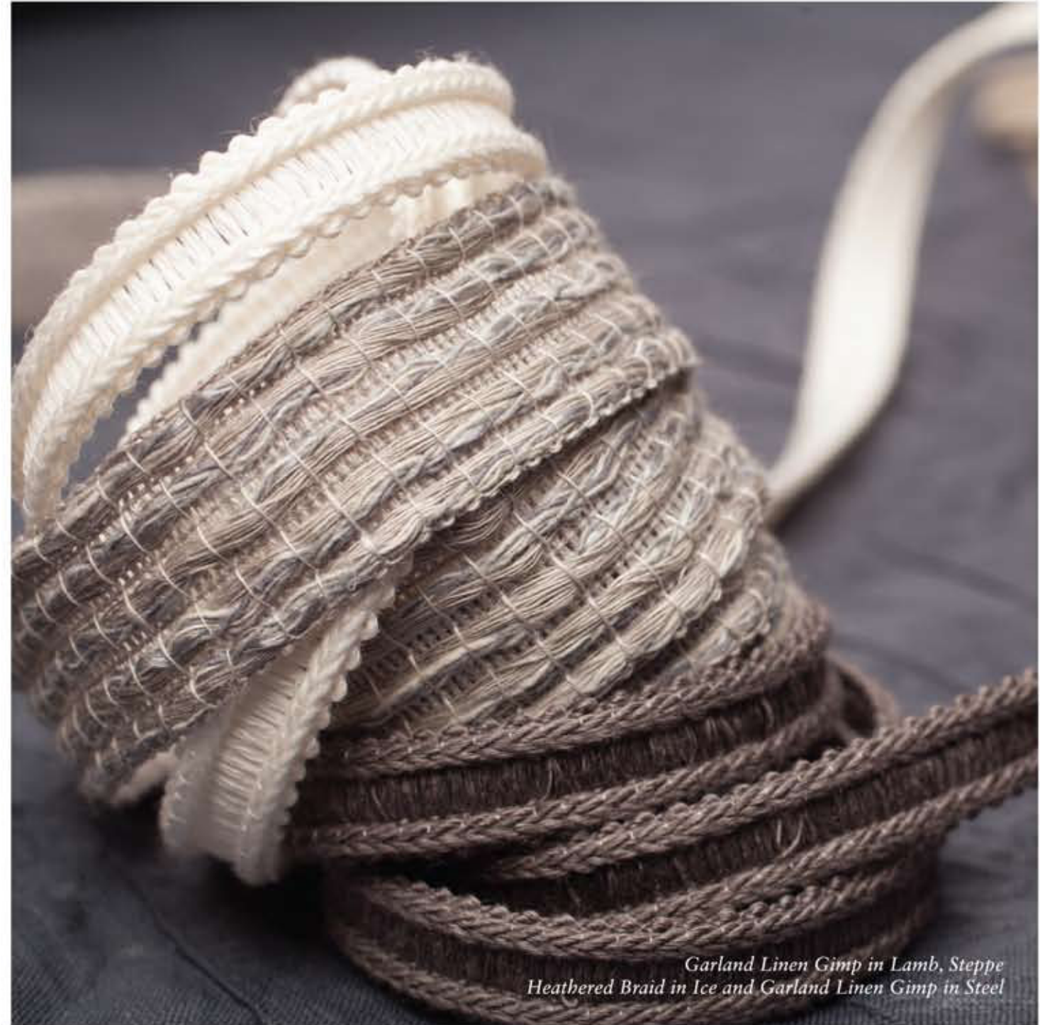
Garland Linen Gimp in Lamb , Steppe Heathered Braid in Ice and Garland Linen Gimp in Steel

The tailored Garland Linen Gimp offers a polished finish to furnishings and accessories with perfectly coordinated tones and subtle stitched details. The Steppe Heathered Braid and Steppe Heathered Cord best exemplify the organic look of the collection. The detailed stitching of the Steppe Heathered Braid creates an undulating finish that exudes an artisan handcrafted charm.