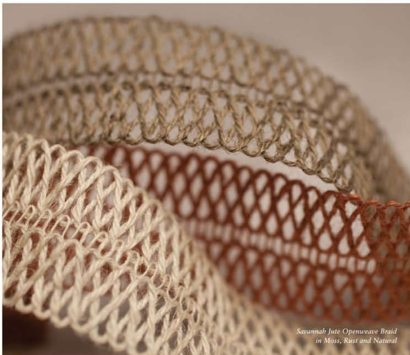
Savannah Jute Openweave Braid in Moss, Rust and Natural

The Underwood Abaca Macrame Braid and Savannah Jute Openweave Braid offer an elegant definition when used alone, however both offer an additional layering opportunity. These dynamic braids can be placed directly on a textile, wallcovering or accessory, or layered over a tape for further dimension.